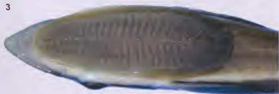
Figure 2. Sharksucker ( Echeneis naucrates) collected from a Northern River Shark ( Glyphis garricki) host in the West Alligator River, Kakadu National Park, Northern Territory.